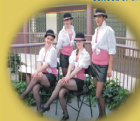
Pizzazz Dance Team